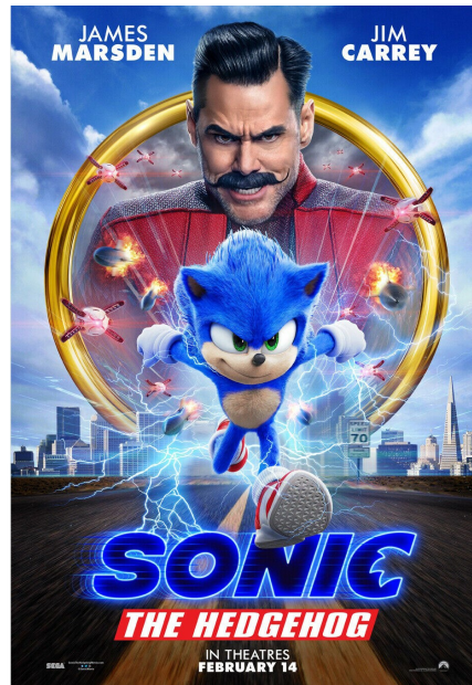
Sonic the Hedgehog February 22