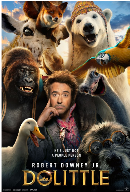
Dolittle January 25

Enjoy the BIG SCREEN experience in an accepting environment! Developed in partnership with Family Hope Foundation, Sensory Showtimes make movies extra welcoming to guests with special needs, including autism. So come relax, be yourself, and enjoy a movie at Celebration! Cinema! Lights will dim, but remain on • Volume will be lowered • Movies begin at show time with limited previews • Shown in 2D with open captioning • Cheering, calling out, or even strolling around the theatre is welcome!