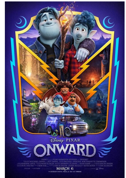
Onward March 14

10:30 a.m. showing with regular matinee pricing. Check the website for a theatre near you at https://www.celebrationcinema.com/cinemas